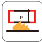
Circuit Integrity IEC 60331-23/BS 6387(Optional)