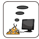
Low Corrosivity IEC 60754-2